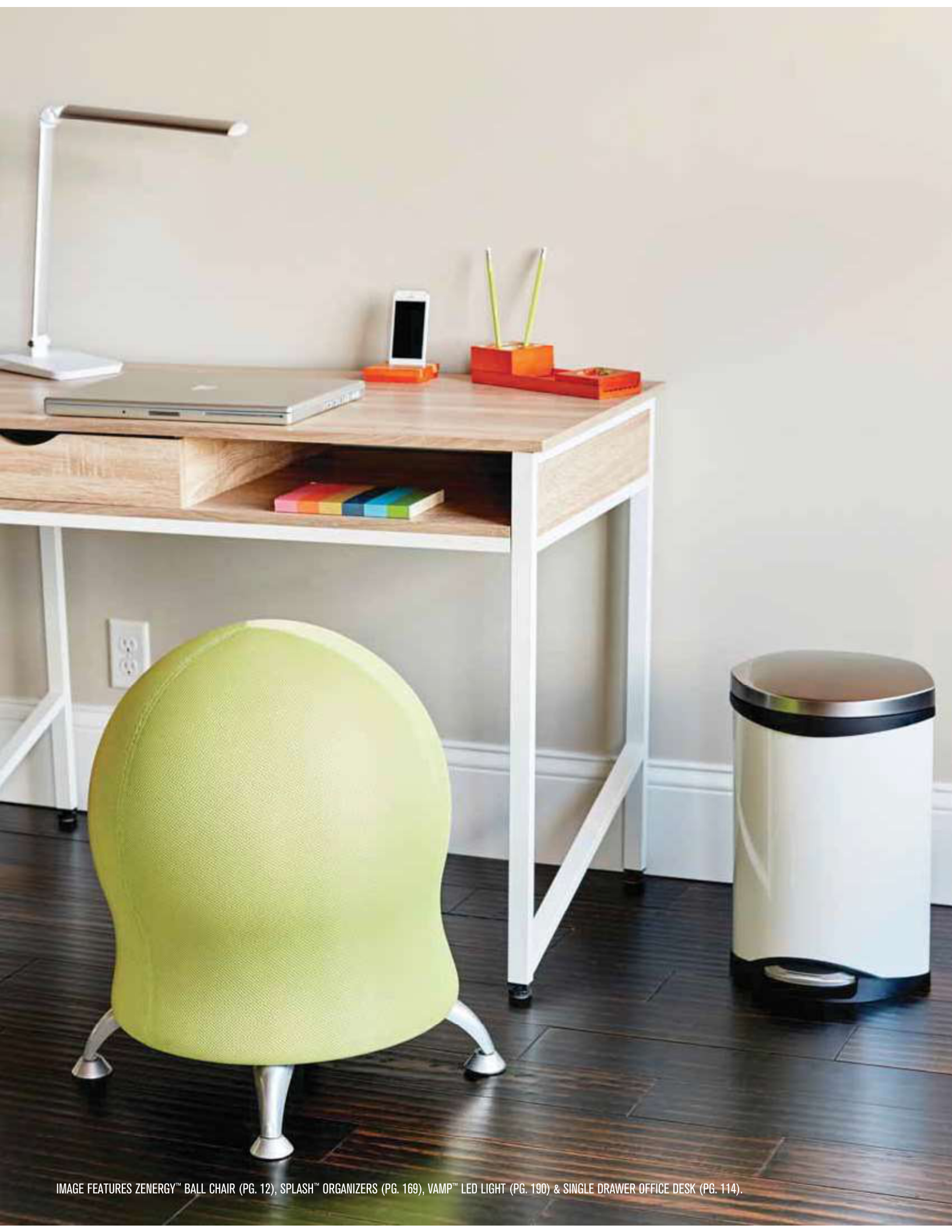
IMAGE FEATURES ZENERGY™ BALL CHAIR (PG. 12), SPLASH™ ORGANIZERS (PG. 169), VAMP™ LED LIGHT (PG. 190) & SINGLE DRAWER OFFICE DESK (PG. 114).