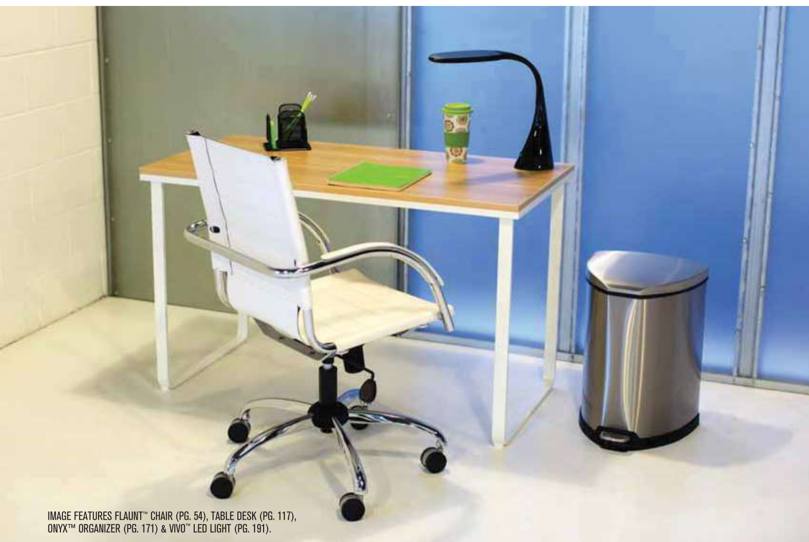
IMAGE FEATURES FLAUNT™ CHAIR (PG. 54), TABLE DESK (PG. 117), ONYX™ ORGANIZER (PG. 171) & VIVO™ LED LIGHT (PG. 191).